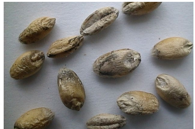
Mouldy wheat kernels