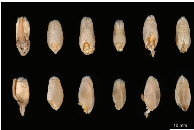
Wheat kernels at various stages of germination

Sprouted wheat kernels should not be infected with moulds.