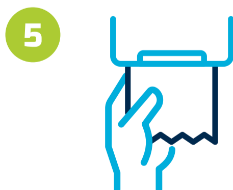
Dry hands using a clean paper towel