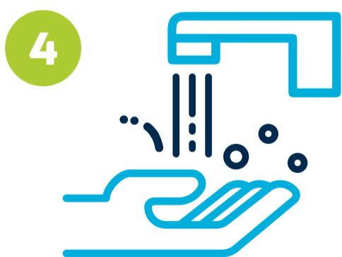
Rinse off soap

Rub soap all over hands for at least 20 seconds